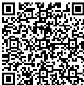
Online Connection Card connect.standrewsonline.net

To help keep everyone safe and healthy, we will not be passing the plate to collect Connection Cards or your offering this morning. You can still do both these things digitally using the QR codes below (just point your phone camera at the squares and follow the prompts). We also have giving boxes at the back; feel free to get up during this time and place your offering in the boxes.