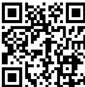
Online Giving give.standrewsonline.net